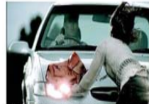
Careful, a still from the latest TAC advertising campaign.