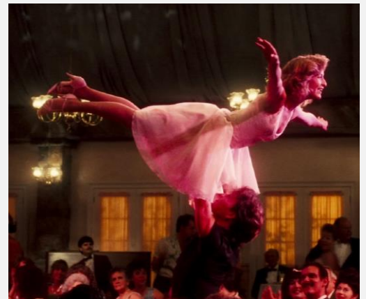
Nobody puts Estelle in a corner